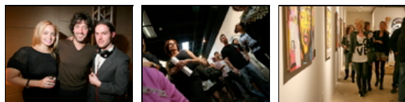
Design Driven at the W Hotel

achievement from the International Photography Awards. I understand the competition was quite stiff, no? My "Republic of China" series was selected among 15,000 submissions from 103 countries. I was also hand-picked to appear in the IPA "Best of Show" Exhibit in late-October in New York. I was extremely honored.